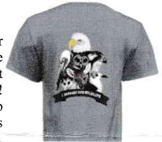
FWMA T-shirt coming soon!